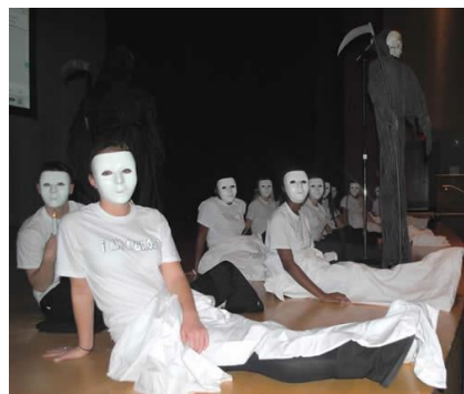
Monarch HS SADD

Send me your photos so that we can all admire your accomplishments!