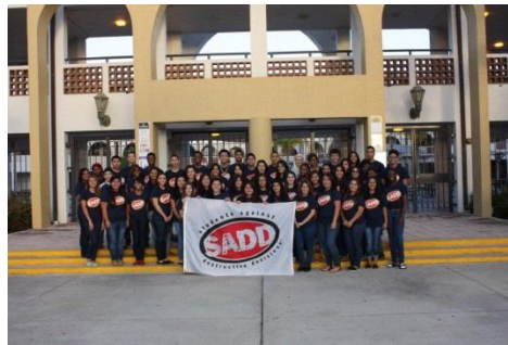
University HS SADD