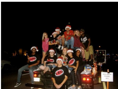
Pine Ridge HS SADD