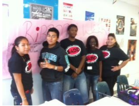
Royal Palm Beach HS SADD