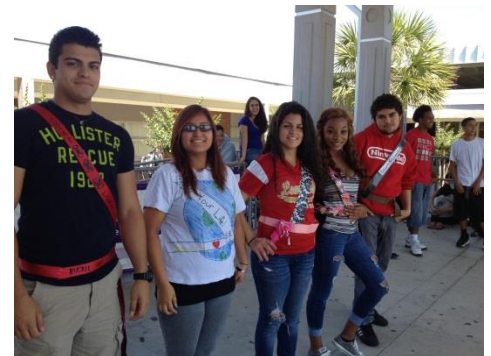
Leto HS SADD