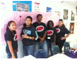
Royal Palm Beach High School SADD Chapter students

“How wonderful it is that nobody need wait a single moment before starting to improve the world.” — Anne Frank