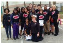
Royal Palm Beach High School SADD Chapter

“How wonderful it is that nobody need wait a single moment before starting to improve the world.” — Anne Frank