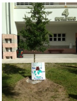
Royal Palm Beach HS SADD chapter planted a tree on school grounds for Arbor Day

“Be yourself; everyone else is already taken.” — Oscar Wilde