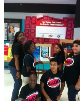
Royal Palm Beach High School SADD students celebrating Red Ribbon Week