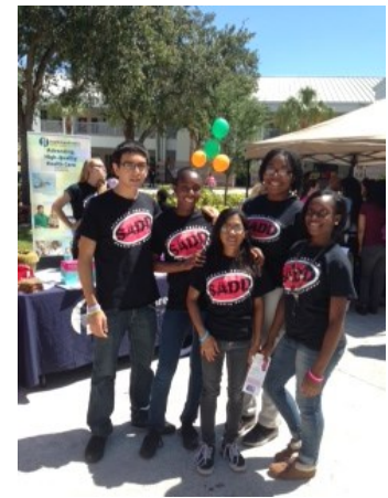
Royal Palm Beach High School SADD at their Wellness Fair