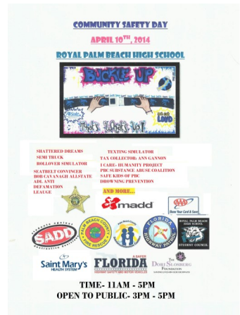
Royal Palm Beach High School SADD safety fair flyer

propriate car seats, booster seats or seat belts – every trip, every time. The campaign ends on September 20 with National Seat Check Saturday, when certified child passenger safety technicians will provide