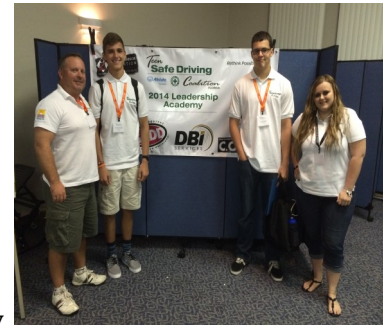
Gulf HS SADD teens and their advisors at the 2014 Leadership Academy