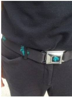
Royal Palm Beach HS SADD students created this wonderful video on seatbelt use and gave out belts with buckles made from seatbelts.

“Be yourself; everyone else is already taken.”