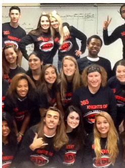
Monarch HS SADD created this super texting/driving video.